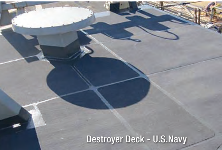
Destroyer Deck - U.S.Navy

It is simply the strongest, hardest and longest-lasting wear surface available anywhere.