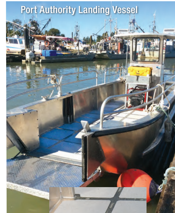
Port Authority Landing Vessel